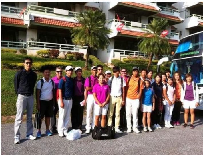
Juniors from Korea, India, Australia, Taiwan, Malaysia, Philippines and Thailand at Panorama Golf & CC.

Hills officials commented, "The course looks great. Greens are running at 9 on the stimp and the accommodation is good!" Preparations are already under way to bring the event back to Panorama again in 2014.