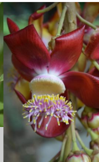
Flowering Trees at The Royal Calcutta Golf Club, Kolkata, India.

1858/15 TCIF Tower 6 th Floor, Bangna-Trad Road, Bangna, Bangkok 10260 Thailand